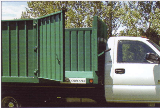
48" curb-side access door