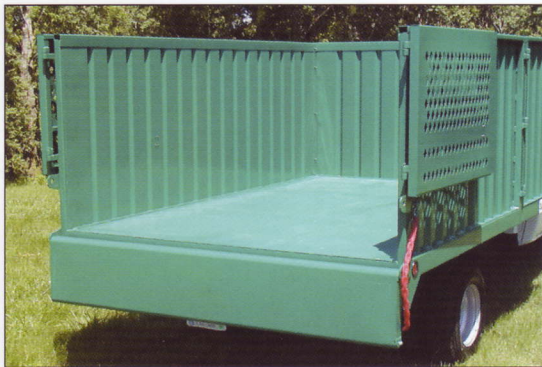
Full opening rear