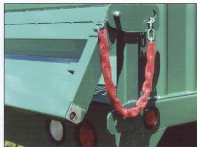
Gate in spreader mode