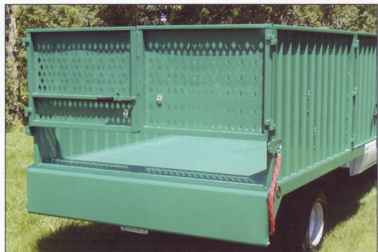
Gate in dump mode