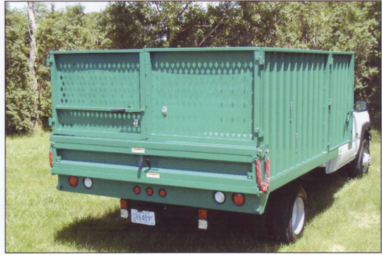
2-piece perforated upper rear doors